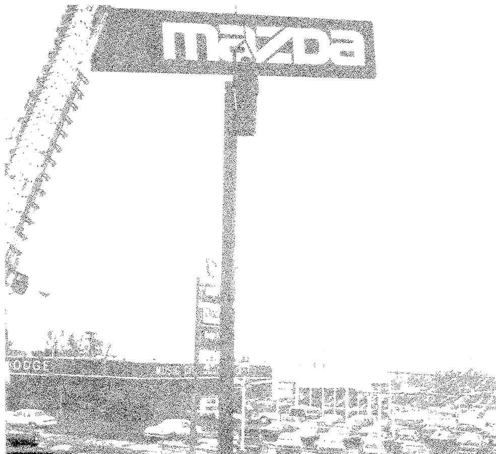
SIGN OF THE TIMES —Neither cold, nor rain, nor fear of heights kept this sign installer from putting the finishing touches on the first sign installation in the new Mazda corporate identity program.